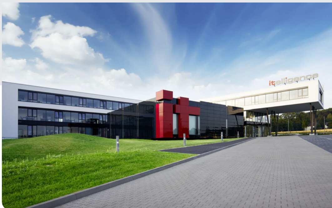
The new itelligence building in Bielefeld.